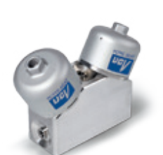
Multi Port Monoblock Valve 2BE