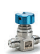
Standard Model 2LD