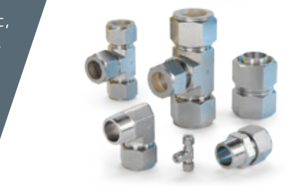
LET-LOK® Compression Tube Fittings 1/16" Through 2" 2 mm Through 50 mm-Metric

FOUNDED IN 1950, HAM-LET Group specializes in the design, development, production and marketing of high quality instrumentation valves and fittings in a wide variety of materials for high pressure, high temperature and vacuum applications. An accent on quality combined with ongoing research and development has given the company an international reputation for excellence. As a result, HAM-LET Group today is the fastest growing company in this industry. We are Totally Committed to our customers providing highest quality products and best of breed service. Our products are used around the world in a wide range of industries, including Energy, Oil & Gas, Ground Turbines, Chemical and Petrochemical, CNG/NGV, Semiconductor, Analytical and others.