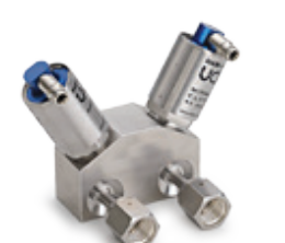
Multi Port Monoblock Valve HMB