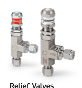
Relief Valves H-900 & H-900HP series