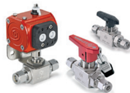
High Performance Ball Valves H-6800 series