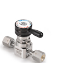
High Pressure High Flow HP