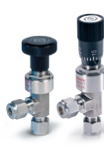
Metering Valves H-1300 series