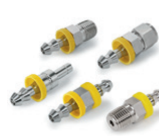
HOSE-END™ HAM-LET Hose Connectors