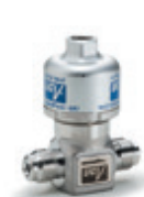
Compact Model 2LE