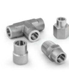
WELDLINE Instrument Weld Fittings