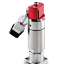
Air Operated Manual Override 2LN (HYBRID)