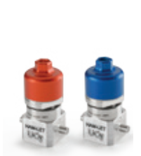
Ultra Clean Metal Diaphragm Valve HMC