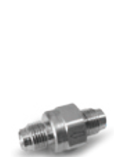
Compact Welded Check Valve CMW