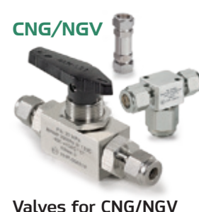
Valves for CNG/NGV Applications ECE R110 approved