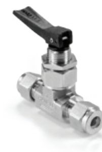
Toggle Valves H-1200 series