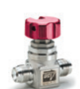
Standard Model Metal Seat 3LD