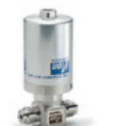
High Pressure Valve 2LH