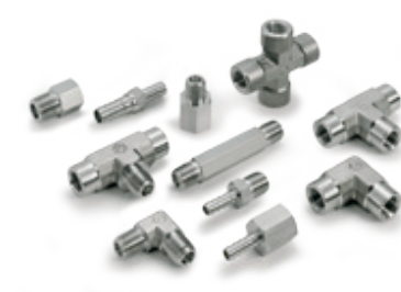
PIPELINE Instrument Pipe Fittings