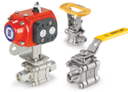
3 Piece Ball Valves H-500 series