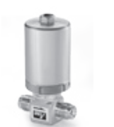
High Pressure High Flow Metal Seat 3LS