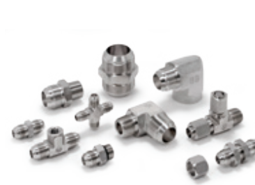
SAE 37° FLARE 37° Flare Fittings 1/8" To 1 1/2"