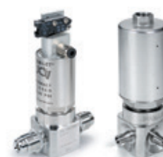
Metal Diaphragm Air Operated HM