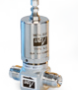
High Temp. Metal Seat 3LT