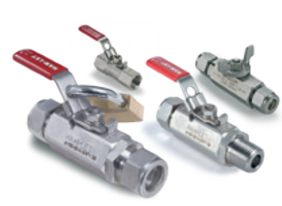
Ball Valves with Locking Device H-700 series