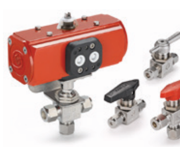
Compact One Piece Ball Valves H-800 series