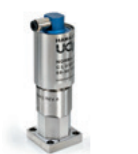
Surface Mount HMS