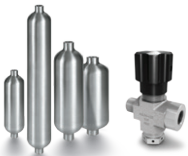
HAM-LET Sample Cylinder and Needle Valve with Rupture Disc

Permit the extraction of a sample from a remote process location and provide safe containment for storage and transportation to the laboratory for analysis. The H-285, HAM-LET Needle Valve with Rupture disc, is designed to be mounted on HAM-LET sample cylinders and provide protection against over pressure by venting the media to the atmosphere.