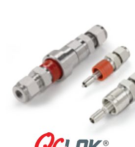
QCLOK® Quick Connectors 1/4", 3/8", 1/2"