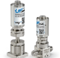
Ultra Fast Diaphragm Valve UF/UFS