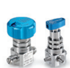
Metal Diaphragm Manual Handle HM