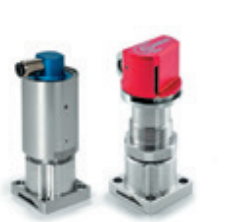
Compact Surface Mount HMSC