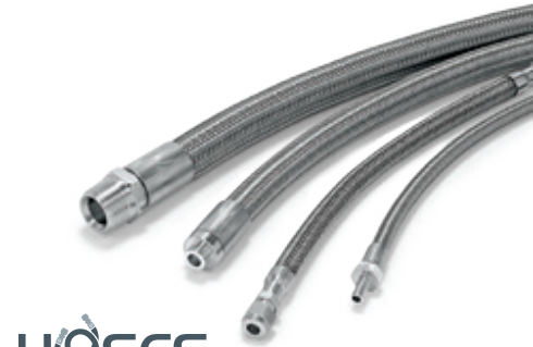
Hoses Flexible Metal & PTFE Hoses

HAM-LET's Hoses lines include full range of high quality SS hose assemblies, wide range of PTFE core SS braided hose assemblies and end connections. Availability of Full Vacuum to High pressure up to 6,000 psi (413bar), 1/4" up to 2" ID range custom length, all tested and individually packed. All HAM-LET hose assemblies are fitted with HAM-LET's quality fittings providing maximum usability and exchangeability with the highest safety levels.