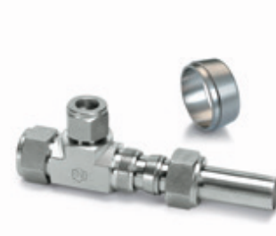
ONE-LOK Single Ferrule Fittings 1/16" Through 1"