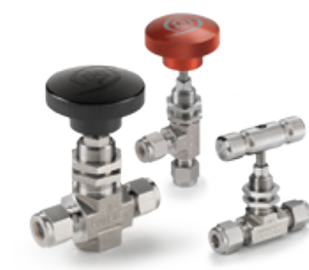
Integral Bonnet Needle Valves H-300U series