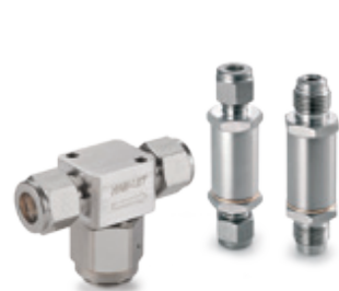
T-Type & In-Line Filters H-600 series