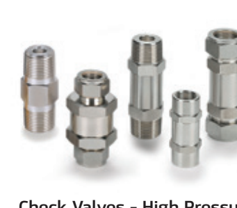
Check Valves - High Pressure, One Piece & Adjustable H-400 series