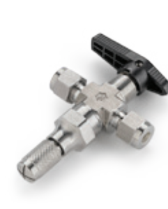
Metering Ball Valves MBV series