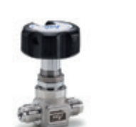
High Pressure Standard Model EVH