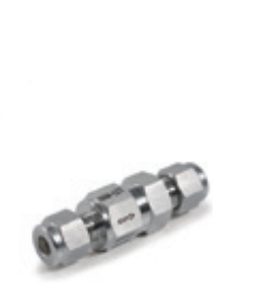
Excess Flow Valves H-911 series