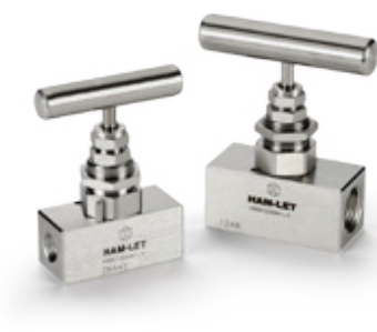
High Pressure Needle Valves H-99 series