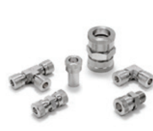
UHLINE Ultra Vacuum Fittings