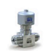
3/4" High Flow 2LDS12