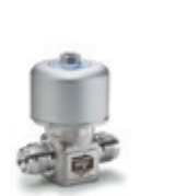
Low Pressure EV