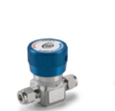
Economic Diaphragm Valve HD