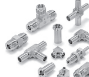
HTC® Orbital Weld and Metal Gasket Face Seal Fittings