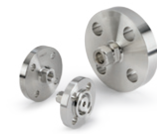
FLANGES HAM-LET Flange Adapters