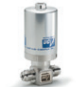
High Pressure Metal Seat 3LH